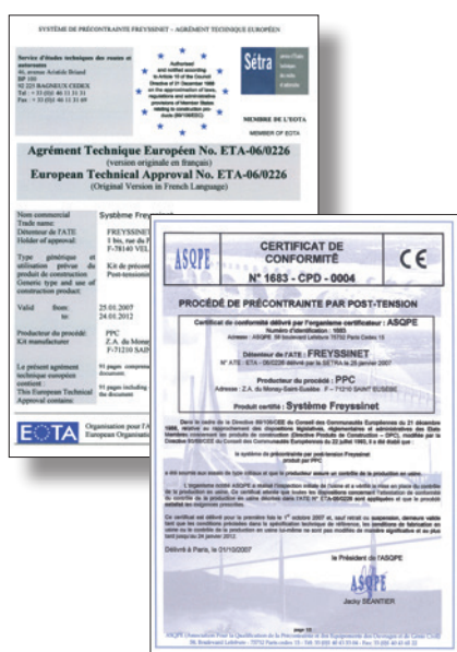
ETAG 013 - "European Technical Approval" and the associated "CE Declaration of Conformity"

Freyssinet is the holder of the ETA n°06/0226, covering the application under cryogenic conditions, and of the CE marking certificate n°1683 - CPD-0004.